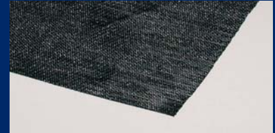
TenCate Polyfelt Geolon® PE

TenCate Polyfelt Geolon® PE woven geotextiles are engineered materials suitable for short and long term filter applications. They are composed of high density polyethylene fibres, assembled to form a structured and stable woven geotextile.